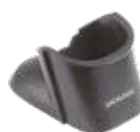
HLD-P080 Desk/Wall Holder (HLD-8000)