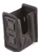
HLS-P080 Universal Holster (HLS-8000)