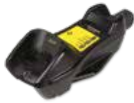
BC9130-BT Base/Dual Charger, Multi-Interface BC9180-BT Base/Dual Charger, Multi-Interface/Ethernet (Standard, Industrial)